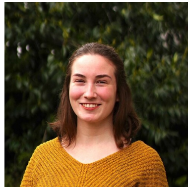
Member Organisation: Grüne Jugend (Germany)