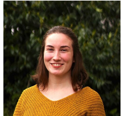
Member Organisation: Grüne Jugend (Germany)