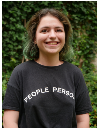
Member Organisation: Zelena molod' Ukrayiny (Ukraine)

Motivation - Vision - CV - Support Letters