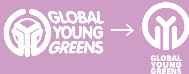
Global Young Greens logo redesign 2020

If I become a member of Ecosprinter, I would propose to collectively generate news ideas on how to improve and refresh Ecosprinter, looking ahead to the European elections of 2024, including a new visual and identity style.