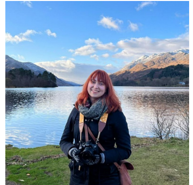
Member Organisation: Scottish Young Greens (Scotland)

Motivation - Vision - CV - Support Letters