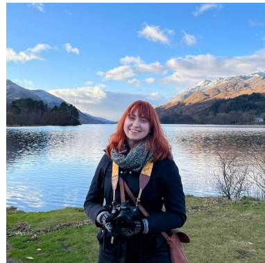
Member Organisation: Scottish Young Greens (Scotland)

Motivation - Vision - CV - Support Letters