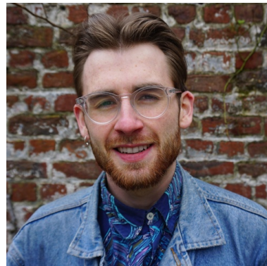
Member Organisation: Scottish Young Greens (Scotland)

Motivation - Vision - CV - Support Letters