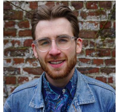
Member Organisation: Scottish Young Greens (Scotland)

Motivation - Vision - CV - Support Letters