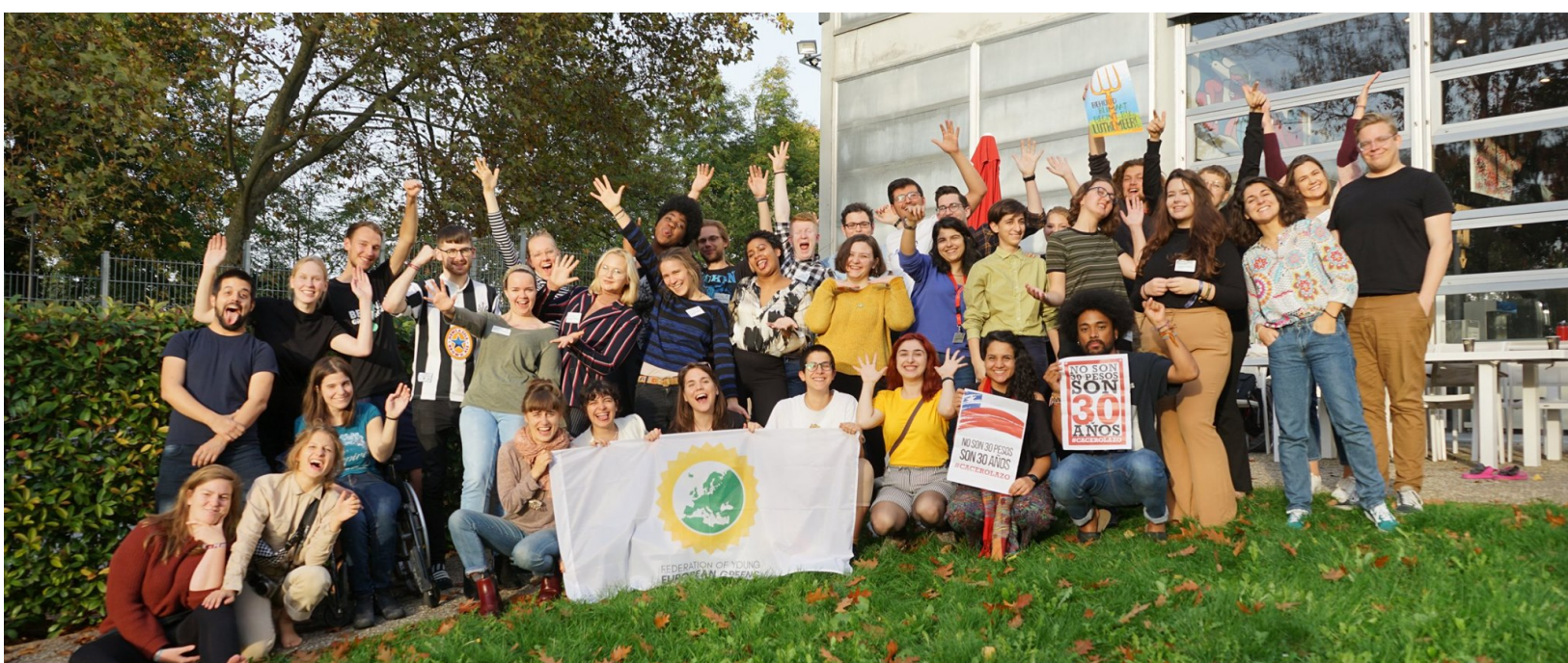
My first prep team. Strasbourg, 2019.

It is an immense pleasure to put myself forward to be the next Co-spokesperson of FYEG. This is a decision that has been shaped by 3 and a half years of activism with the organisation. It's a decision made thanks to countless coffees, beers, and Zoom calls with past and present FYEGers. Most of all, it's a decision shaped by what FYEG has given me. From crying happy tears on a dancefloor in Strasbourg to marching with antifascists in Bologna, this organisation has given me so many emotions, so many lessons, and so many friendships.