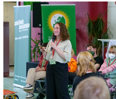
Member Organisation: Grüne Jugend (Germany)