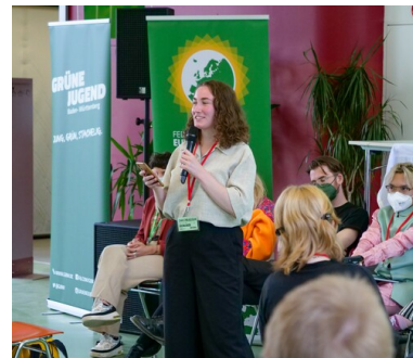
Member Organisation: Grüne Jugend (Germany)