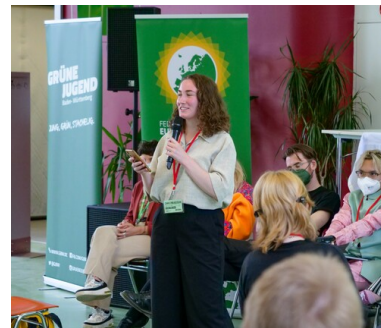
Member Organisation: Grüne Jugend (Germany)