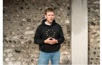
Member Organisation: Grüne Jugend