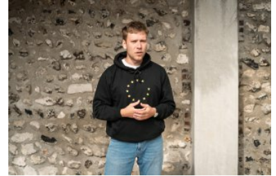
Member Organisation: Grüne Jugend