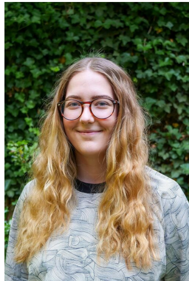
Member Organisation: Grønn Ungdom