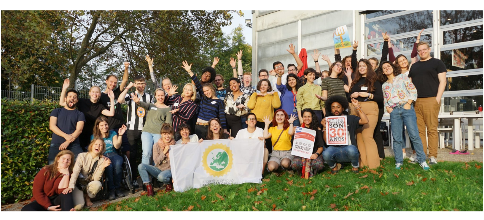
My first prep team. Strasbourg, 2019. Just a few months after the last European election.

It has been the pleasure of a lifetime to serve FYEG for the last year and I am hungry for more. Our impact is growing, and we need to make it count this year like no other.