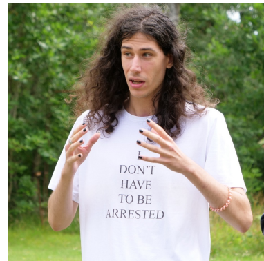
Member Organisation: Zelena omladina Srbije - Serbia