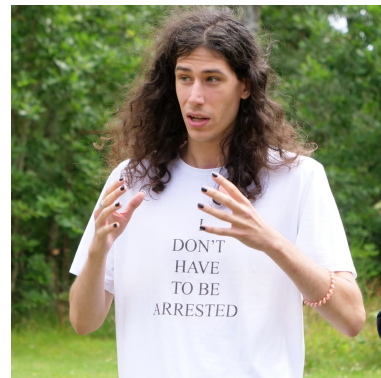
Member Organisation: Zelena omladina Srbije - Serbia