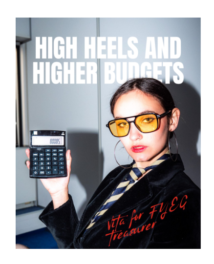
Member Organisation: DWARS, GroenLinkse Jongeren

With the increasing defunding of civil society, I believe we can't afford to be broke. We need to be bold, resilient, and united! To grow our movements, win elections, and support our members, we need to be smart both politically and financially.