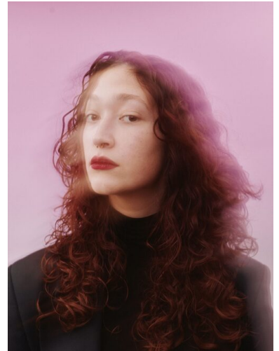
Member Organisation: Vihreiden nuorten ja opiskelijoiden liitto