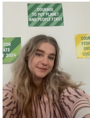
Member Organisation: DWARS - GroenLinkse Jongeren