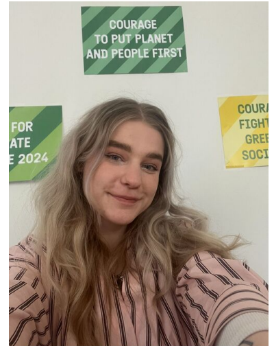
Member Organisation: DWARS - GroenLinkse Jongeren

Dankjewel, and see you in South Tyrol!!!