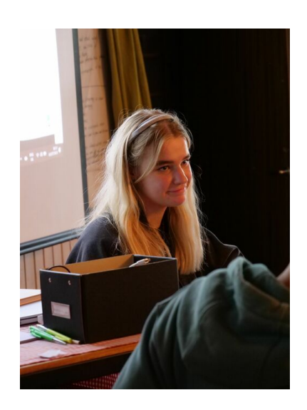
<u>Member Organisation:</u> DWARS GroenLinkse Jongeren Netherlands