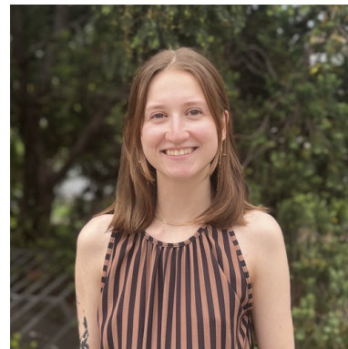
Member Organisation: déi jonk gréng - Luxembourg