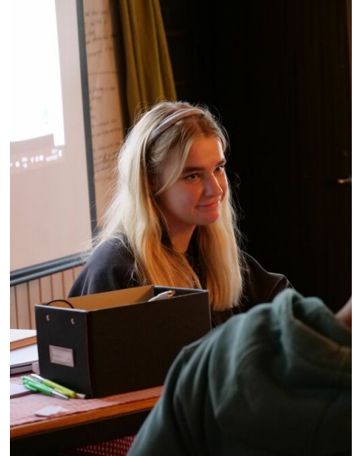
Member Organisation: DWARS GroenLinkse Jongeren - Netherlands