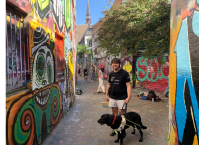
Member Organisation: Young Greens of England and Wales